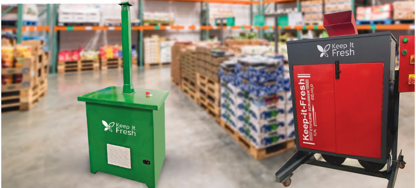
KIF SCRUBBER PLUS 50,000 CFT AREA