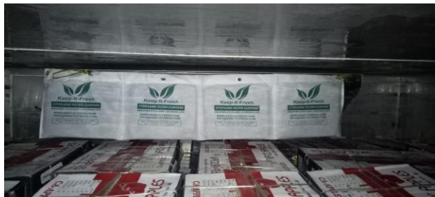
KIF curtain in apple reefer