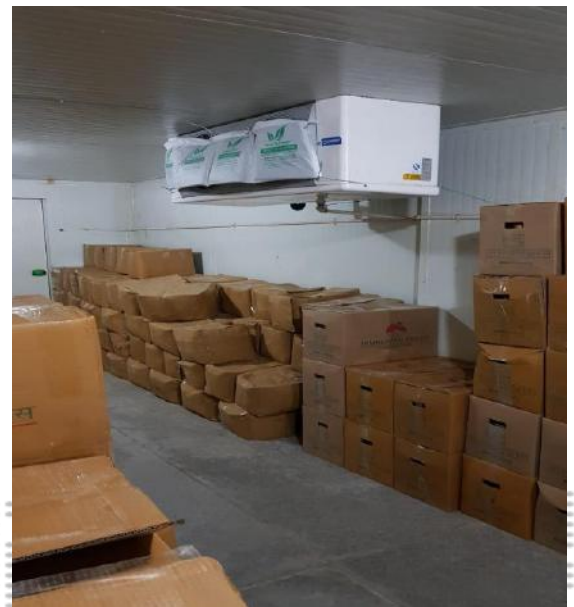
KIF curtain in apple cold storage at Nepal