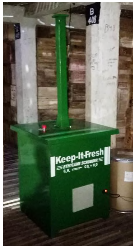
KIF Scrubber ES 657 At Roshan Frozen Ice & Cold Storage, Kundali Sonipat Haryana.

Keep It Fresh LLP - 18 Sec 6 Manesar, Gurugram, India USA - 14310 Gannet St , La Mirada, California info@keep-it-fresh.com www.keep-it-fresh.com Italy | France | India | China | Mexico