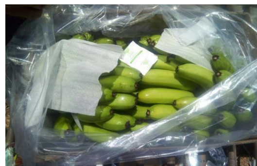
KIF Sachet in banana export box