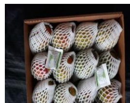
KIF Sachets in mango export boxes