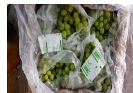
KIF Sachets in Grape export boxes