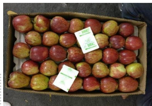
KIF Sachets in apple export box